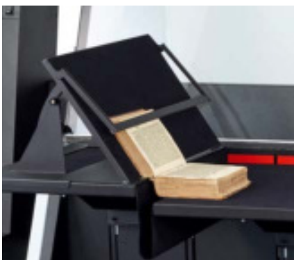
Bookholder on Copyboard OT 180 H 35 XL