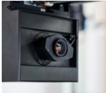
Camera system based on a CMOS sensor