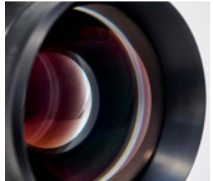
Perfect interplay between high-quality technical components