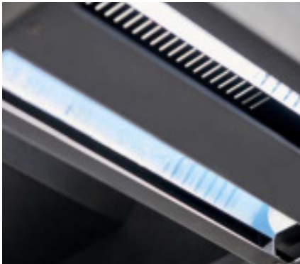
LED lighting system for reflection-free and shadow-free results