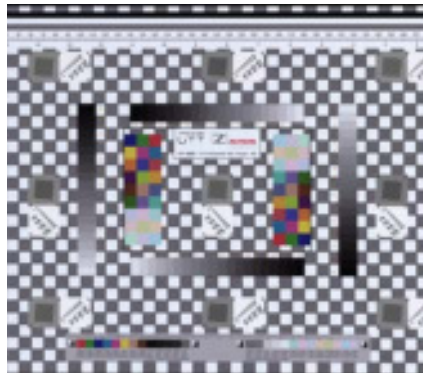
Fulfills ISO 19264-1 Level A, Metamorfoze Full and FADGI 4 Star