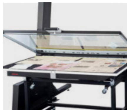
Toplight Table AT 0 with opened glass plate