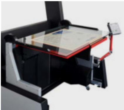
Wide range of interchangeable imaging systems